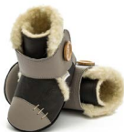
Soft Soled Booties