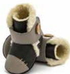
Soft Soled Booties